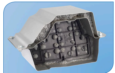
L&L Seal heat expanded baffle system.