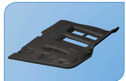
DECI-TEX molded insulation panel.