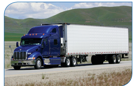
Lighter, stronger, quieter and safer trucks.

L&L's structural reinforcement technologies can strengthen, stiffen and improve crash and acoustic performance in all types of light, medium and heavy trucks. L&L Reinforce solutions can enable down gauging or reduced substrate wall thickness without loss of structural integrity in aluminum and steel body structures.