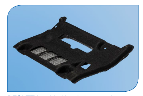
DECI-TEX molded insulation panel.

L&L's structural reinforcement technologies can strengthen, stiffen and improve crash and acoustic performance in all types of agricultural vehicles. L&L Reinforce solutions can enable down gauging or reduced substrate wall thickness without loss of structural integrity in aluminum and steel body structures.