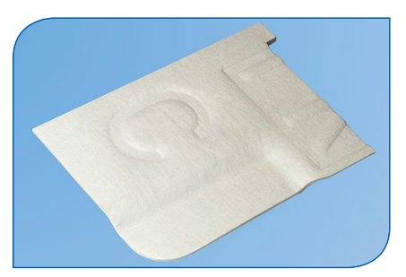
DECI-TEX insulation panel.