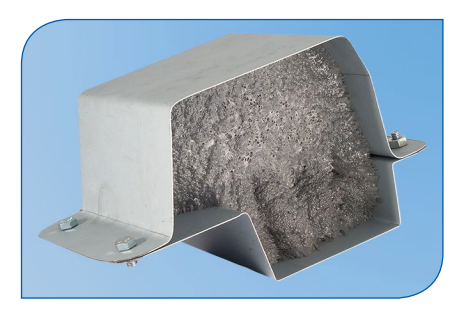
L&L Seal heat expanded baffle system.