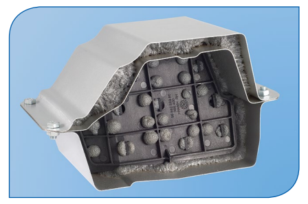
L&L Seal heat expanded baffle system.