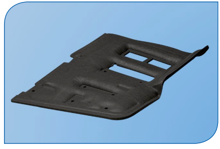
DECI-TEX molded insulation panel.