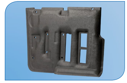
DECI-TEX molded insulation panel.