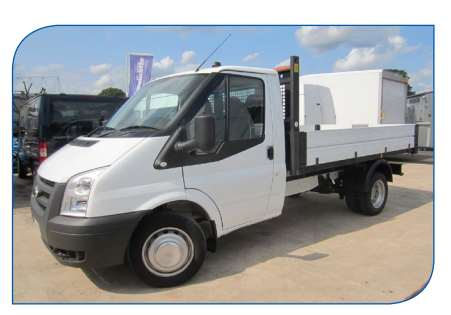
Stronger, quieter and safer light trucks.

L&L's structural reinforcement technologies can strengthen, stiffen and improve crash and acoustic performance in all types of light trucks. L&L Reinforce solutions can enable down gauging or reduced substrate wall thickness without loss of structural integrity in aluminum and steel body structures.