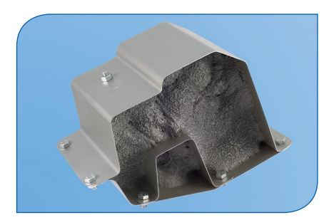
L&L Seal heat expanded baffle system.