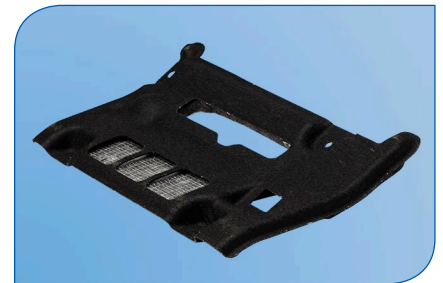
DECI-TEX molded insulation panel.