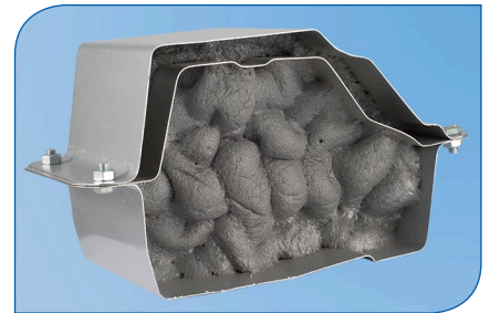
L&L Seal heat expanded baffle system.