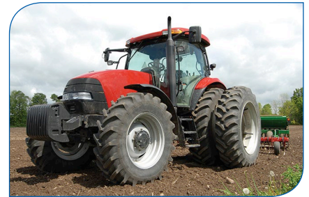
Lighter, stronger, quieter and safer.

L&L's structural reinforcement technologies can strengthen, stiffen and improve crash and acoustic performance in all types of agricultural vehicles. L&L Reinforce solutions can enable down gauging or reduced substrate wall thickness without loss of structural integrity in aluminum and steel body structures.